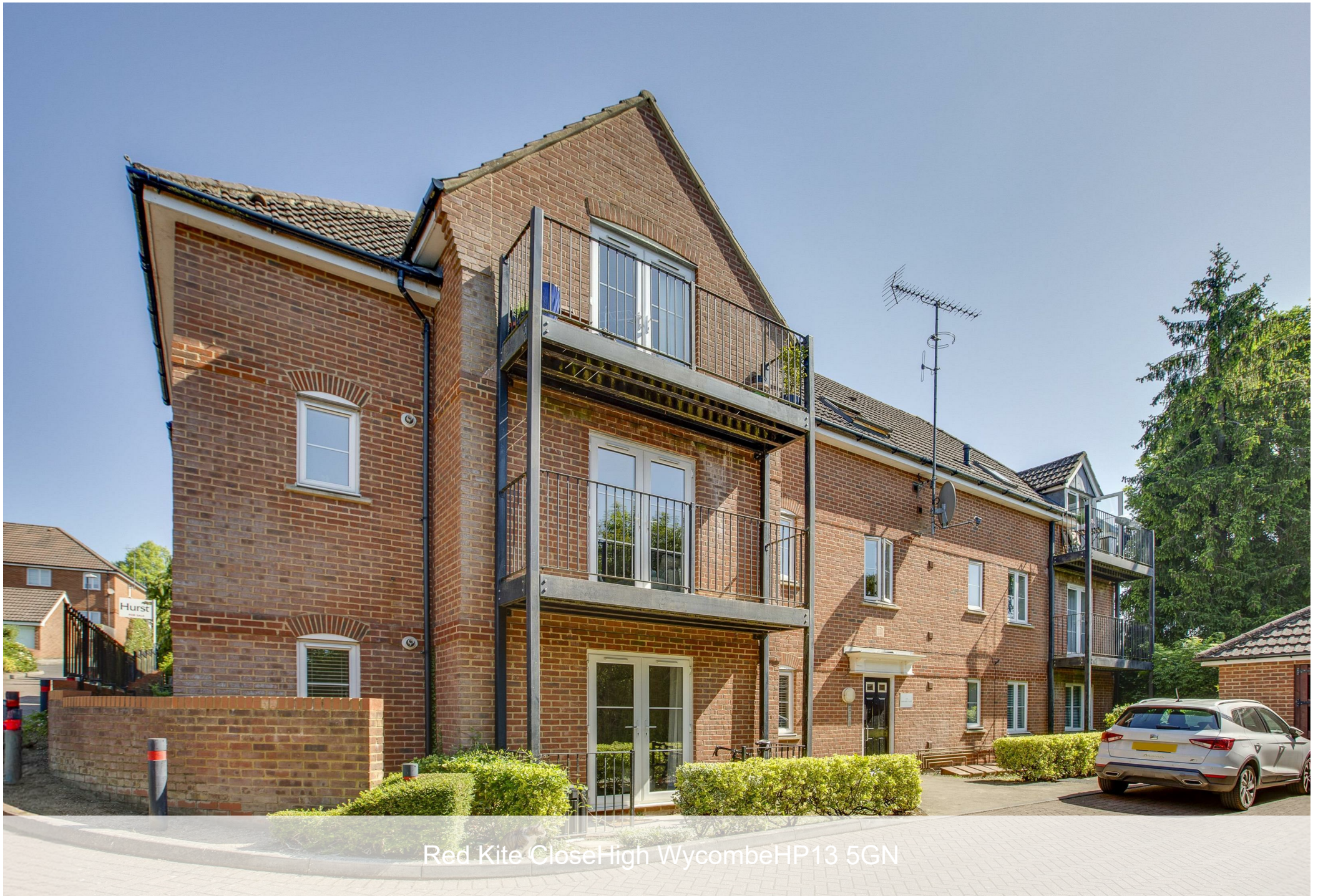
Red Kite Close High Wycombe HP13 5GN